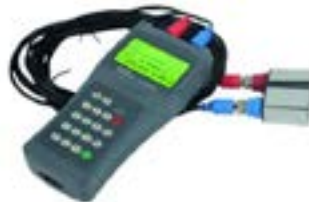
HANDHELD FLOW METER