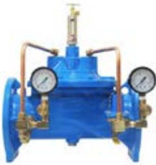
PRESSURE REDUCING CONTROL VALVE

Envotec in Safety & Flow Control Products offers Pressure Reducing Control Valve, Modulating Float Control Valve, Solenoid On/off Control Valve, 2-1/2" To 6" Float Valves, Equilibrium Float Valve, Pressure Reducing Valve With Built-in Strainer And Direct Acting Type Pressure Relief Valves.