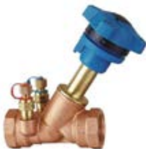
FIXED ORIFICE DOUBLE REGULATING VALVE