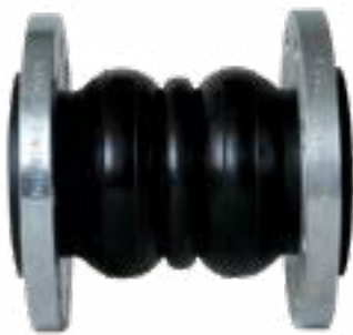
DOUBLE SPHERE FLANGED RUBBER EXPANSION JOINT

Envotec has Expansion Joints Products such as Double Sphere Flanged Rubber Expansion Joint, Double Sphere Screwed Rubber Expansion Joint, Heavy Duty Dismantling Joint And Epdm W/ Brass To Steel Galvanized Rubber Expansion Joint. In Flexible Connector Products Line, It Offers Corrugated Copper Connectors, Rigid Faucet Connectors And Flexible Faucet Connectors.