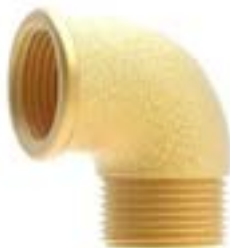
90° MALE - FEMALE REDUCING ELBOW