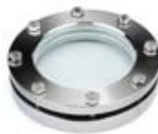
STANDARD SIGHTGLASS FITTINGS