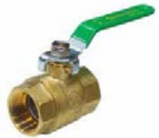
FULL PORT BRASS BALL VALVE