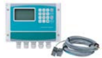
ULTRASONIC FLOW METER