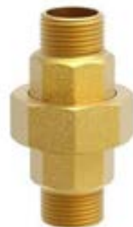
MALE - MALE FLAT SEAT UNION