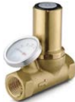
TEMPERATURE BALANCING VALVE