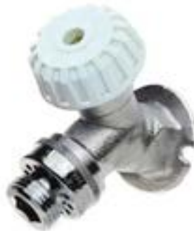
HOSE BIBB VACUUM BREAKER