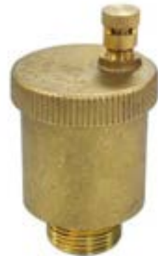
BRASS AUTOMATIC AIR VENT