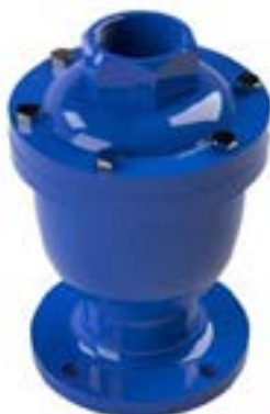
AIR & VACCU VALVE