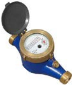
BSPT/NPT THREADED WATER METER

Envotec in Safety & Flow Control Products offers BSPT/NPT Threaded Water Meter, Flanged Water Meter, Flanged Static Balancing Valve, Fixed Orifice Double Regulating Valve, Ductile Iron Flanged Foot Valves, Brass/ Bronze Foot Valves, Electromagnetic Flow Meter, Handheld Flow Meter and Equilibrium Ball Float Valve With Balanced Single Seat.