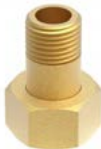
CONNECTION FOR WATER METER