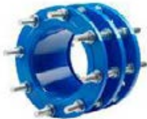
HEAVY DUTY DISMANTLING JOINT