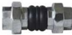
DOUBLE SPHERE SCREWED RUBBER EXPANSION JOINT