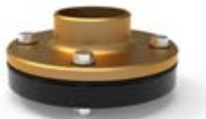
DIELECTRIC FLANGED PIPE FITTINGS