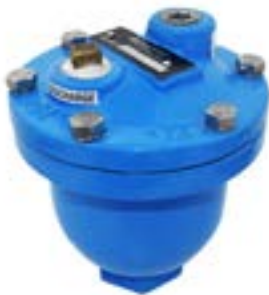
AUTOMATIC AIR VENT

Envotec HVAC Solutions include Automatic Air Vent, Automatic Air Vent ETA-6, Bronze Automatic Air Vent, Automatic Air Vent ETA-4, Brass Automatic Air Vent, Air and Vacuum Valve, Air Separators, Air Separators with Strainer, Manual Airvent, Thermostatic Mixing Valve, Vacuum-Relief-Valve-EV15 and Vacuum Relief Valve.