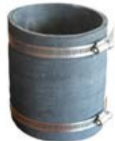
EPDM W/ CLAMPS