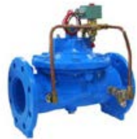
SOLENOID ON/OFF CONTROL VALVE