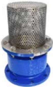
DUCTILE IRON FLANGED FOOT VALVES