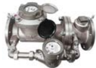
COMPOUND WATER METER