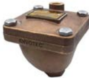
BRONZE AUTOMATIC AIR VENT