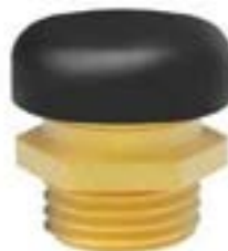
VACUUM RELIEF VALVE