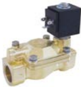
GENERAL PURPOSE SOLENOID VALVE

Envotec offers E21W & E22W General Purpose Solenoid Valves. They also offer Lug Butterfly Valves, Two Way Ball Valves, Brass Angle Valve, Metallic Seated Flap Valves, Brass Needle Valves, Cast Iron/ Ductile Iron Gate Valve, Diaphragm Valves with Lining and Cast Iron Flanged Y Strainers.