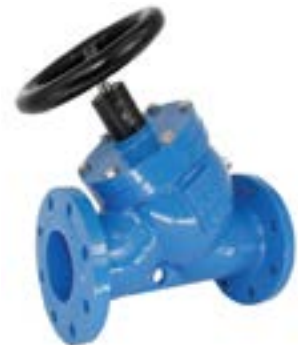
TRIPLE DUTY VALVE