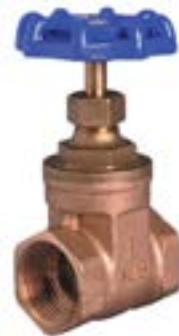
BRONZE GATE VALVE