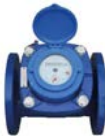
WOLTMAN (TURBINE) WATER METER