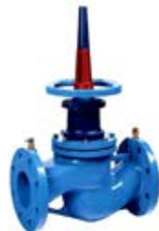
FLANGED STATIC BALANCING VALVE