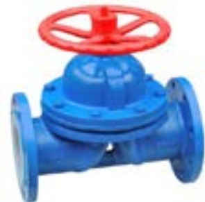
DIAPHRAGM VALVE WITH LINING