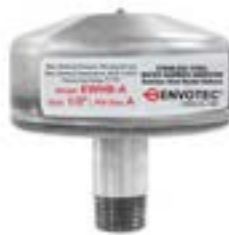
STAINLESS STEEL WATER HAMMER ARRESTORS