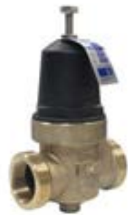
PRESSURE REDUCING VALVE WITH BUILT-IN STRAINER