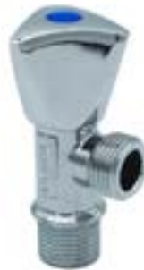
CHROME PLATED BRASS ANGLE VALVE