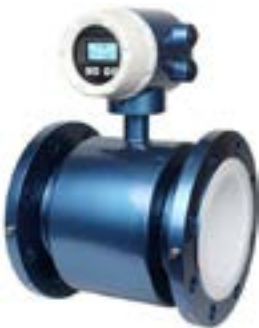
ELECTROMAGNETIC FLOW METER