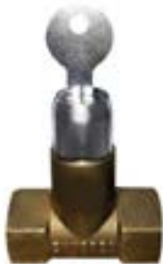
LOCKABLE BALL VALVE