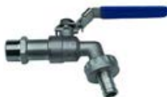
STAINLESS STEEL BIB TAP