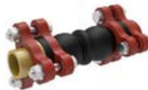
EPDM W/ BRASS TO STEEL GALVANIZED RUBBER EXP. JOINT