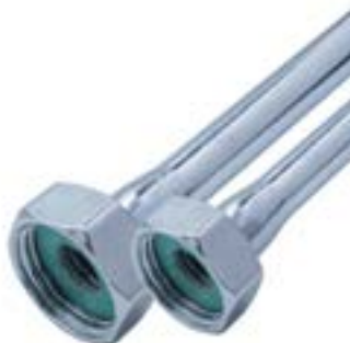
RIGID FAUCET CONNECTORS