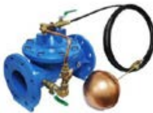
MODULATING FLOAT CONTROL VALVE