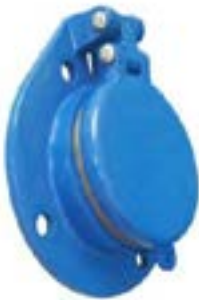
METALLIC SEATED FLAP VALVE