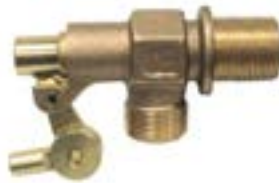
MECHANICAL TYPE EQUILIBRIUM FLOAT VALVES