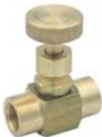
BRASS NEEDLE VALVE