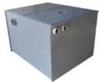
OIL INTERCEPTOR WITH BUILT-IN STORAGE TANK