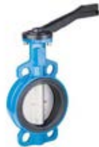
LUG BUTTERFLY VALVES