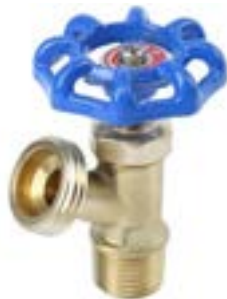
BOILER DRAIN VALVE