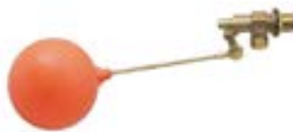
3/8" TO 1" FLOAT VALVES