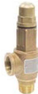
DIRECT ACTING TYPE PRESSURE RELIEF VALVES