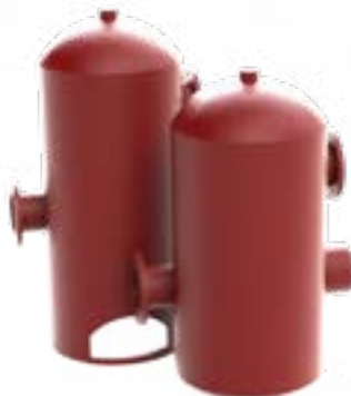
AIR SEPARATORS WITH STRAINER