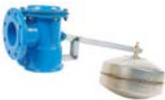
EQUILIBRIUM BALL FLOAT VALVE W/ BALANCED SINGLE SEAT