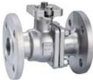
TWO WAY BALL VALVE