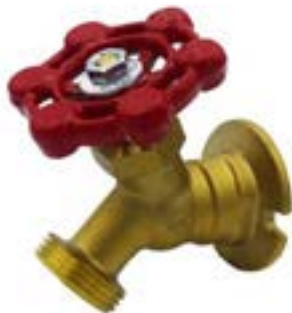
HOSE BIBB HOSE UNION