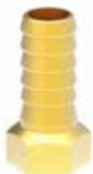
FEMALE HOSE TAIL