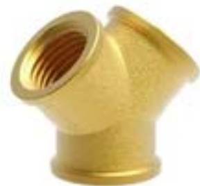
FEMALE - FEMALE - FEMALE 'Y' FITTING