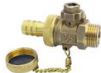
MALE TAPERED BOILER DRAIN