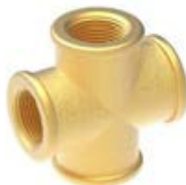
FEMALE CROSS FITTING