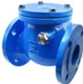
SWING CHECK VALVE