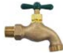
HEAVY DUTY HOSE BIBB