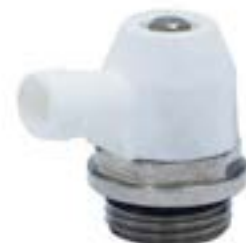
MANUAL AIR VENT