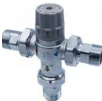
THERMOSTATIC MIXING VALVE