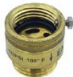
HOSE CONNECTION VACUUM BREAKER