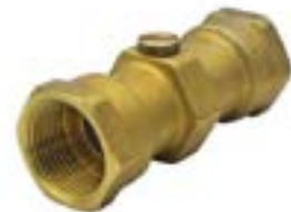
DOUBLE CHECK VALVES