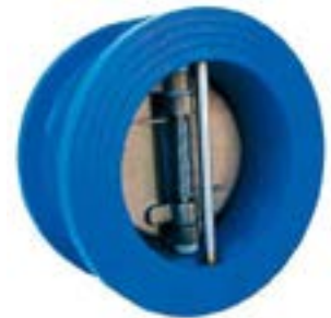
WAFER TYPE DOUBLE DISC CHECK VALVE