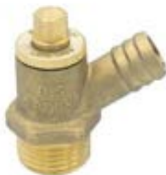
DRAIN COCK WITH HOSE END